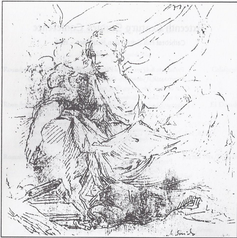
From Allegory of Learning , Guido Reni (1575-1642)